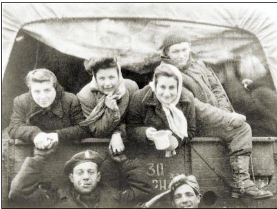
Soldiers in the Jewish Brigade with Jewish survivors, Marseilles, France, 1946.

Beth Hatefutsoth, Ghetto Fighters' House, Yad Vashem, Return to Life . Haifa, Israel: Ayalon Offset Ltd., 1995. (Also a 60-minute video)