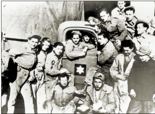
Soldiers of the Jewish Brigade, Italy, 1945, with Jewish remnants.

Jewish soldiers in the British Army, Middle East, 1941, carrying a Torah to a religious service in the desert.