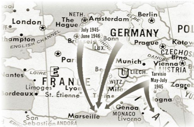
Brigade locations after the war (high-lighted). The movement of Jewish refugees, aided by the Brigade, 1945-1946 (arrows).