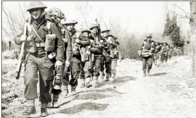
The Jewish Brigade on the Italian Front, Spring, 1945.

Q: Immediately following the war, Jewish Brigade soldiers left their unit at Tarvisio, often going AWOL to look for family members. Was their absence justified?