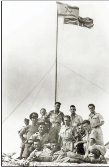
The flag mutiny of the Palestine Regiment, 1943, Benghazi, Egypt.