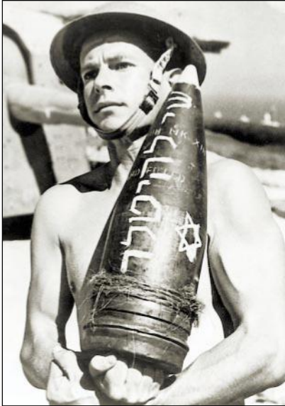
A Jewish soldier in the British Army, Middle East, 1942, prior to the Brigade’s formation. Hebrew writing on shell reads: “Greetings to Hitler.”

Q: Explain the roles of the Jewish Agency and the Haganah. Why was the Jewish Agency called “the government-in-waiting?”