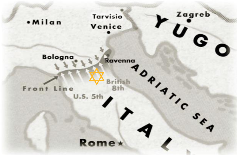
The Brigade's position along the front line, Spring, 1945.