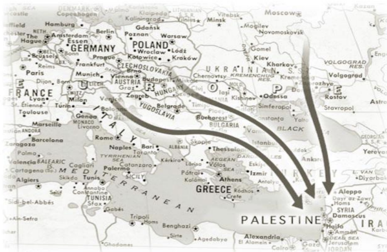
The migration of Jews from Europe to Palestine, 1920's and 1930's.