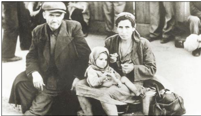
A Jewish family during the Bricha, or flight out of Central Europe, 1946.

The self-defense arm of the Jewish Agency in Palestine, this force was organized to protect Jewish settlements during the period of British Mandate. In 1948, the